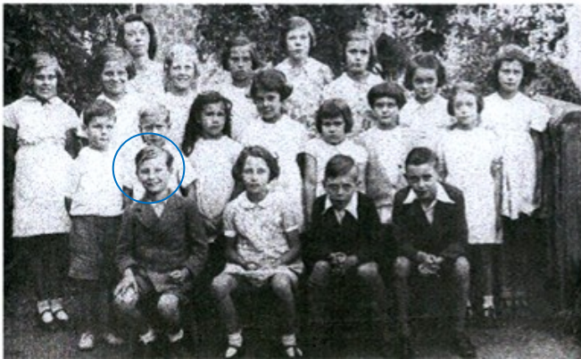
Salford Village School 1940 (Village Hall).