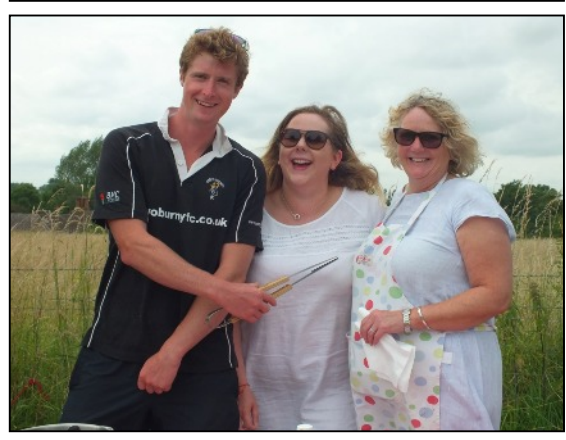
More smiles and cheekiness at the burger bar

enjoyable, it is very likely that this year it has exceeded all previous monies raised for donation to MacMillan. All-in-all we have a pleasant, very special and unique village hall loved by all!