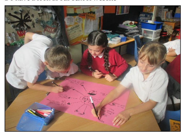
Story planning with friends

www.hclowerschool.co.uk which has more information about your very own local village school; transport by minibus is provided by Central Bedfordshire to and from Hulcote and Salford, which are our official 'catchment' villages. If you are thinking about a place for your child for September 2017 then why not come and visit us? If families move into our catchment area we will always try our best to accommodate children.