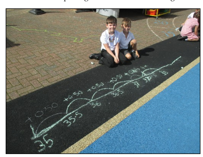
Learning outside the classroom - fun with Maths

One of our enterprising Year 4 children has single