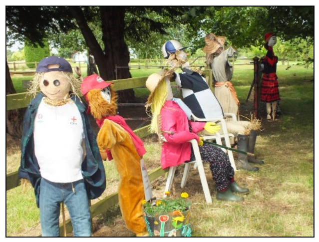
Some of the entries in the scarecrow competion

The next event to be held was the Hulcote & Salford Summer Fete held, for the first time too, romantically under the lime trees leading up to the church. This event was a combined 'do', to celebrate the lately-finished refurbishment of the 12th century church, to include Husborne Crawley and its school (they leapt up to the mark with energy and enthusiasm!) and of course, to hold a fete for the villages for the first time in many years. The whole day went extremely well.