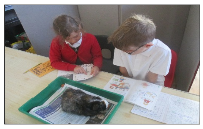
Come and read to a Guinea Pig

handedly helped to raise a large amount of money for Cancer Research UK. TK Maxx with Cancer Research UK run a campaign every year called "Give Up Clothes For Good". The campaign asks for good quality items, from clothes to home ware. The current campaign is for research into children's cancer and also to help make a